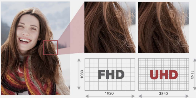
Figure 2. UHD high pixel density provides accurate detail representation.

QMD Series delivers four times the FHD resolution on the same screen area, resulting in the most accurate recreation of details possible. Text that displays on QMD Series in UHD is super-crisp due to its high pixel density. High-detail visuals, such as photos and videos, are visible with the smallest details for a hyper-realistic and immersive visual experience.