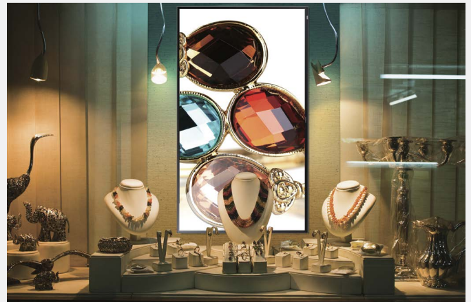
Figure 1. Commercial applications can leverage QMD Series clarity and operational capabilities.

Samsung QMD Series SMART Signage features a new design and delivers 3,840 x 2,160 resolution, multi-format PIP support, DP 1.2 support, set-back box (SBB) support, portrait or landscape orientation and reliable 16/7 operation for amazing flexibility and picture clarity in commercial settings. For example, retail stores can leverage Samsung QMD Series with UHD to improve their brand image and showcase products in sharp detail, while corporations and arena or museum security centers can use the high-resolution displays to enhance security with stable and vivid content playback.