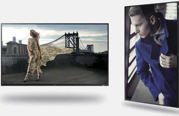
Figure 4. Pivot mode to fit the aesthetic setting while delivering dynamic content.

To meet the demands of traditional commercial environments, digital signage is often installed in portrait mode. Thus, it is critical that the digital signage supports portrait installation to fit to the aesthetics of the setting while still delivering the dynamic qualities of digital signage. QMD Series offers pivot mode that allows them to be installed in either landscape or portrait orientation to suit the environment's needs.